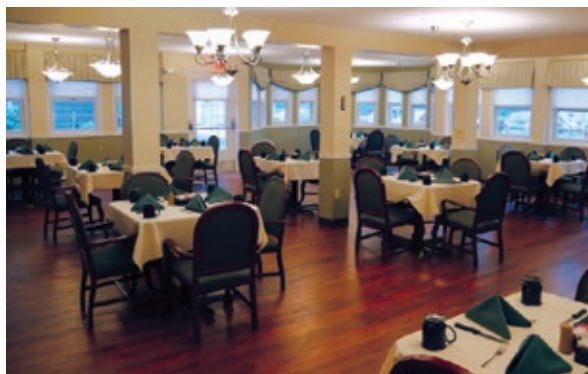
Community dining room