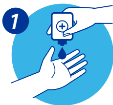
Apply sanitizer on the palm of one hand