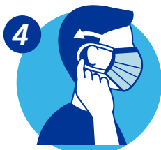
Secure strings behind your head or over your ears