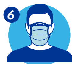
Check seal and ready to go

To learn more about our resident visitation policy and requirements, go to: lorettocony.org/visitation